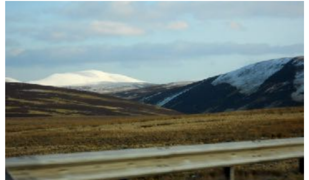
Uk Snow Mountains